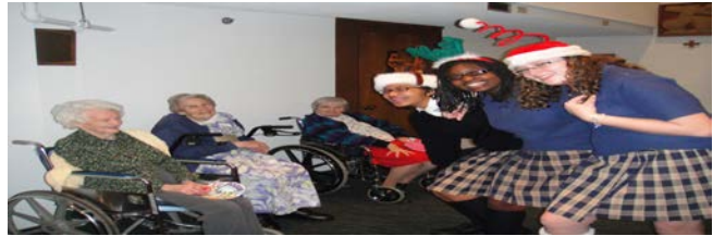
Bringing Christmas Cheer to McAuley Hall