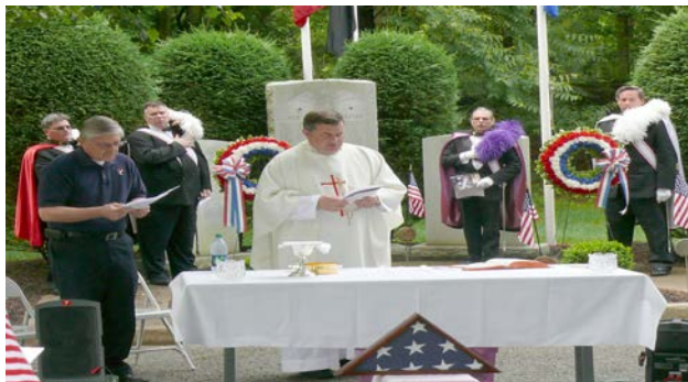
Annual Memorial Day Mass at New Calvary Cemetery